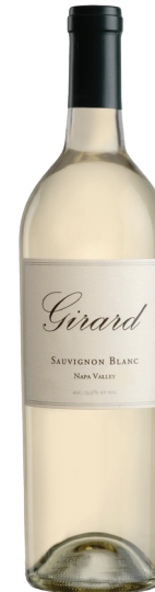
Sauvignon Blanc Napa Valley