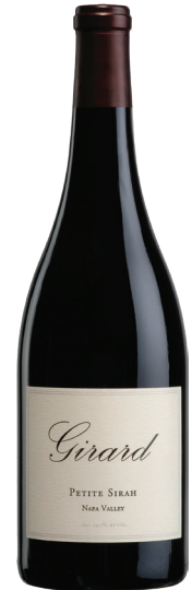
Petite Sirah Napa Valley