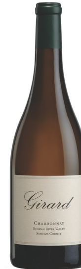
Chardonnay Russian River Valley