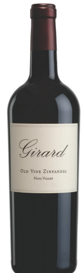
Old Vine Zinfandel Napa Valley