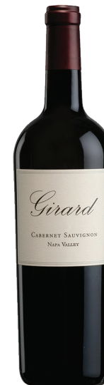
Cabernet Sauvignon Napa Valley