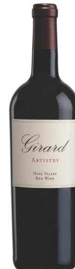
Artistry Napa Valley