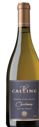
Dutton Ranch Chardonnay Russian River Valley