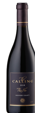
Monterey County Pinot Noir Monterey County On Premise Only