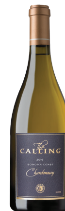
Sonoma Coast Chardonnay Sonoma Coast