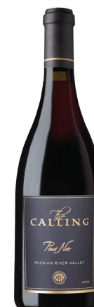
Russian River Valley Pinot Noir Russian River Valley